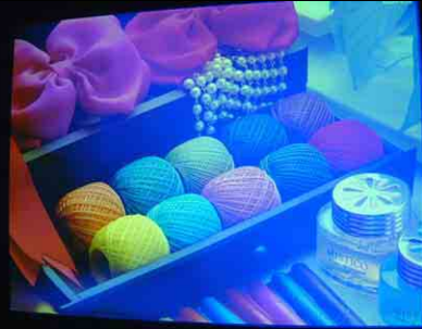
Photo at 24 hours